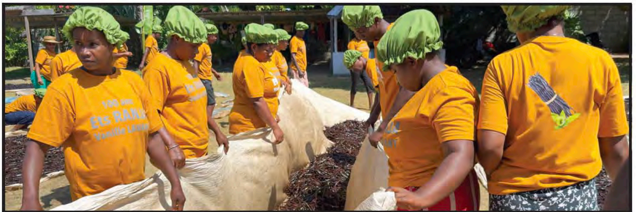
The maturing team at our Manambato maturing station in Antalaha - Madagascar.