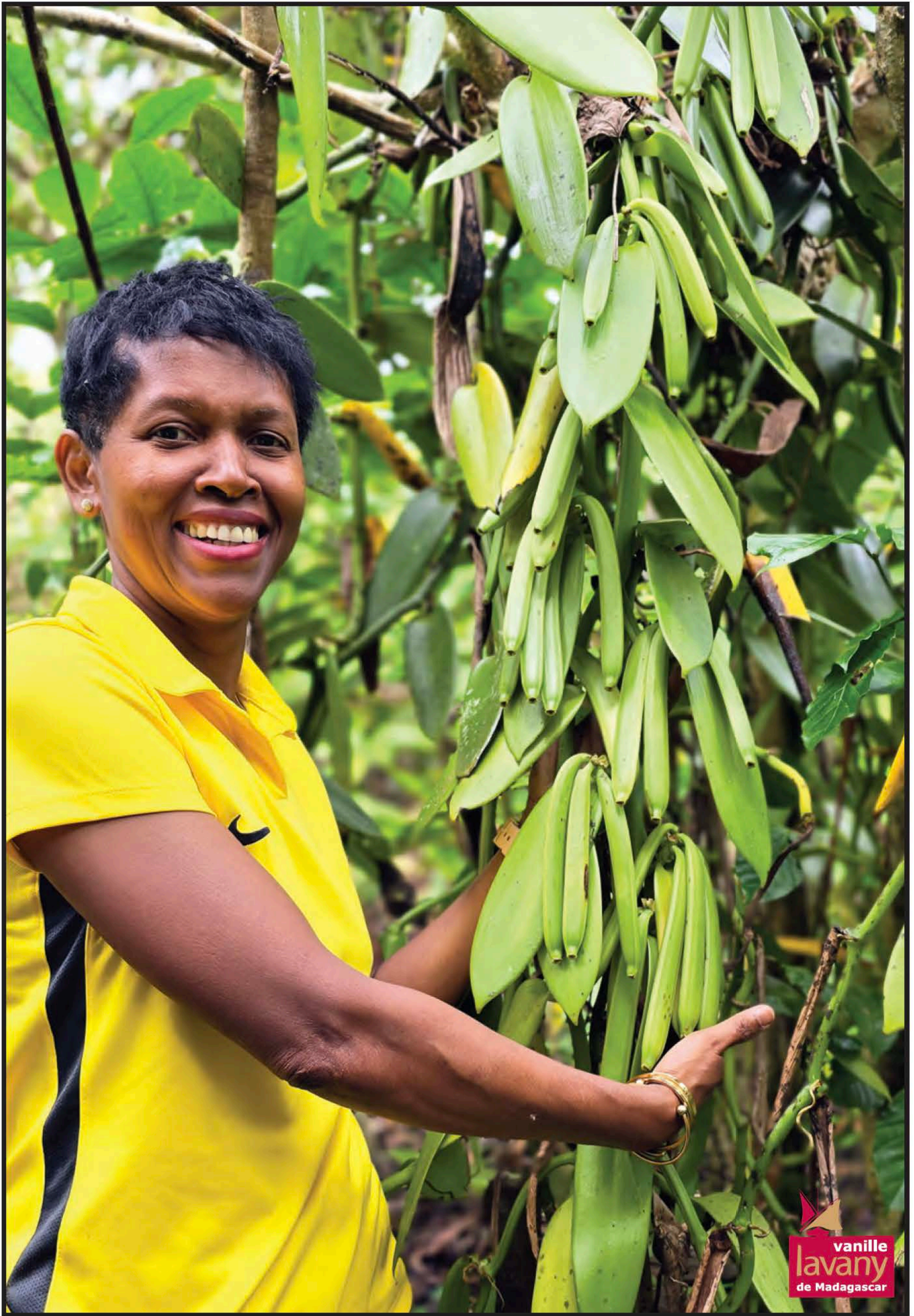
LAVANY Vanilla liana with mature pods ready to be harvested.