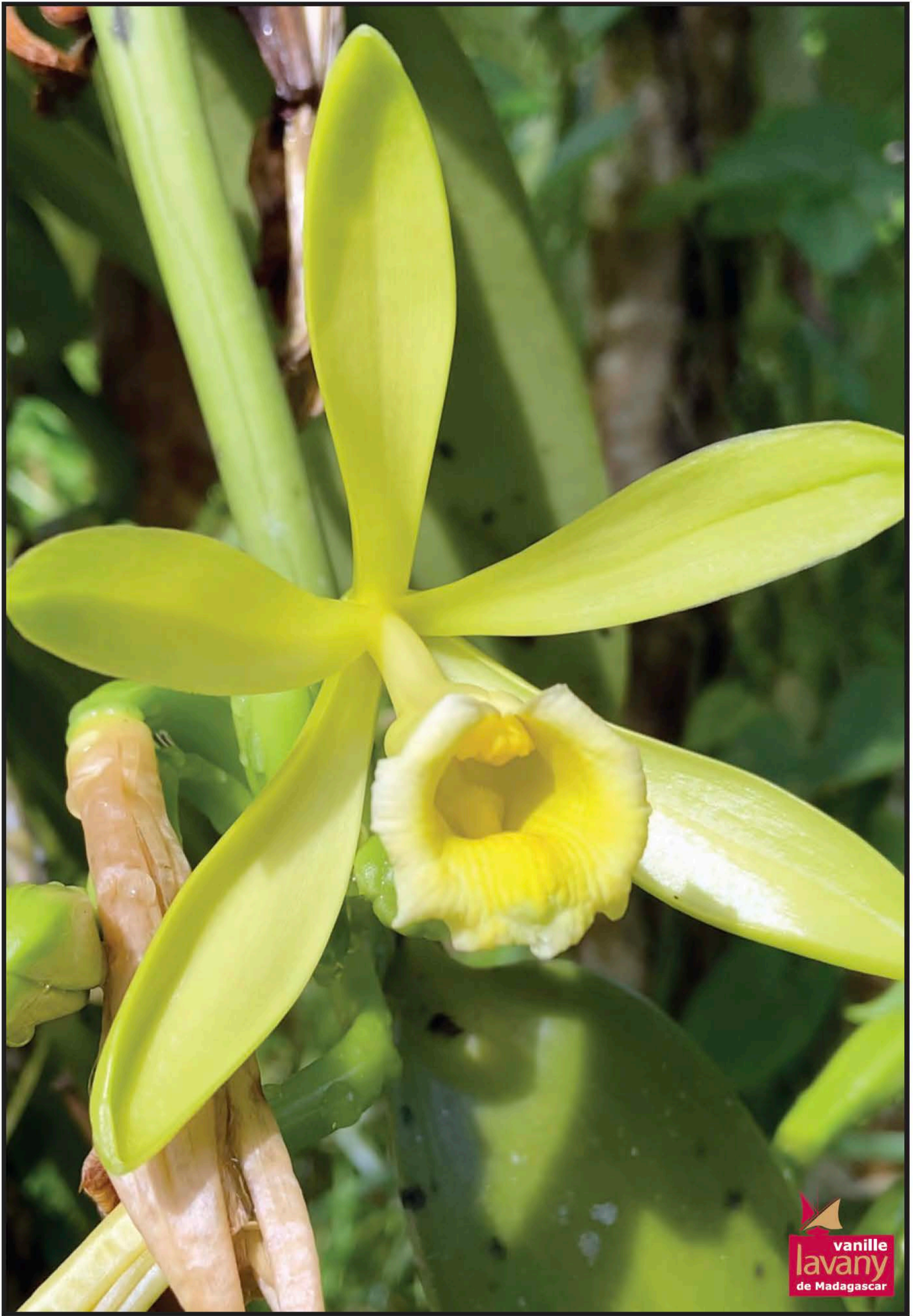
Freshly bloomed, unfertilized LAVANY Vanilla flower.