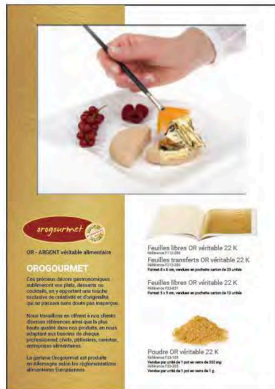
4-page catalog downloadable from the website.

The Orogourmet range is produced in Germany according to European food regulations.