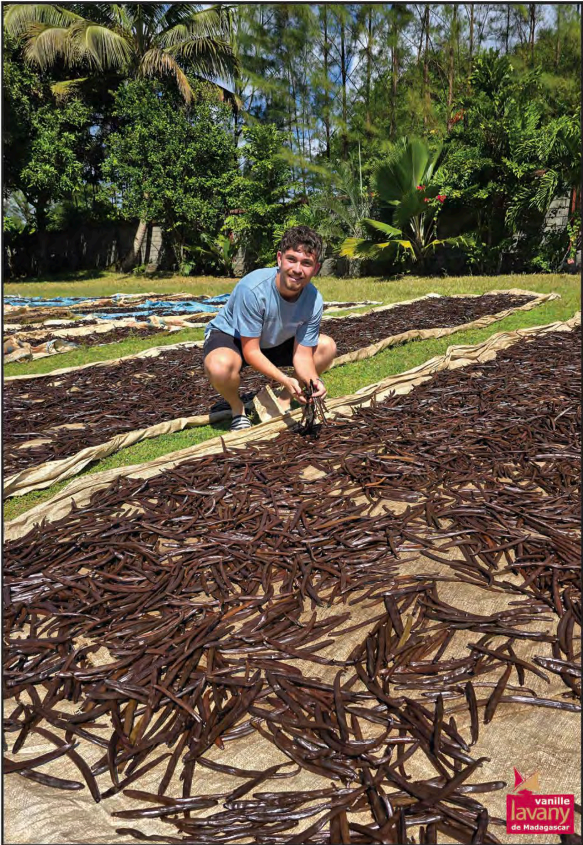
Outdoor drying under the trade winds of the Indian Ocean at Manambato, our refining station in Antalaha.