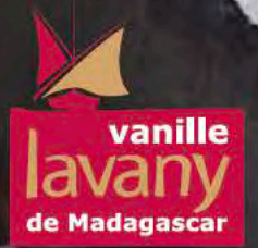
Scalding LAVANY green Vanilla.